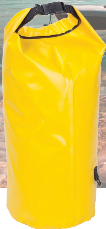
WX 003 XX 60 litres