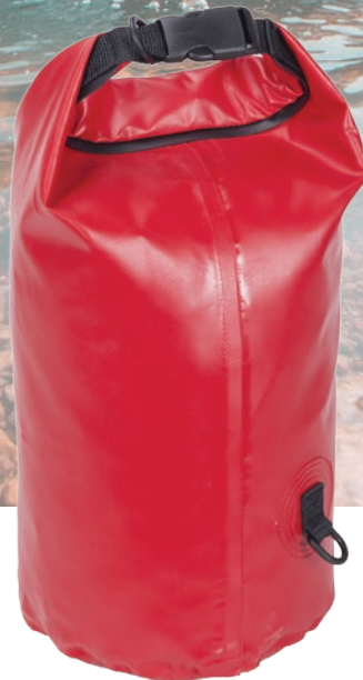
WX 002 XX 30 litres